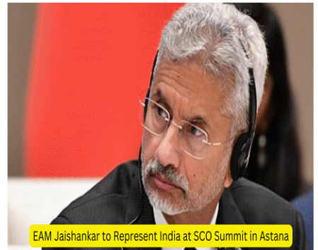
EAM Jaishankar to Represent India at SCO Summit in Astana

(A) Foreign Minister S. Jaishankar is representing India at the annual summit of the Shanghai Cooperation Organization in Astana. The summit, being held on July 3-4, is expected to focus on the regional security situation and ways to boost connectivity and trade. Kazakhstan is hosting the summit in its capacity as the current Chair of the group.