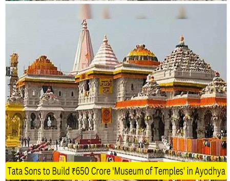
Tata Sons to Build ₹650 Crore 'Museum of Temples' in Ayodhya

(D) The Uttar Pradesh Cabinet has approved Tata Sons' proposal to build a temple museum in Ayodhya. The project is worth Rs 650 crore and will be financed through Tata's Corporate Social Responsibility Fund. Apart from this, the state cabinet has also approved Rs 100 crore for further development works in Ayodhya.