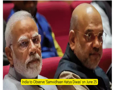
India to Observe 'Samvidhaan Hatya Diwas' on June 25

(C) Remembering the Emergency, the Central Government has decided to celebrate 25th June every year as Constitution Killing Day. A notification in this regard has been issued by the Central Government. Emergency was imposed in the country on 28 June 1975. The purpose of this decision is to honor the struggle of millions of people who fought to revive democracy despite facing countless tortures and oppression from the dictatorial government.