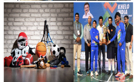
Kalaingar Sports Kit Scheme

(C) Tamil Nadu Youth Welfare and Sports Development Minister Udhayanidhi Stalin recently announced a pioneering scheme aimed at nurturing sports talent at the grassroots level. The Kalaingar Sports Kit initiative, named after late Kalaingar Karunanidhi, is set to provide sports kits to 12000 gram panchayats across the state.