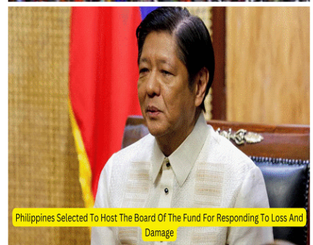
Philippines Selected To Host The Board Of The Fund For Responding To Loss And Damage

(B) The Philippines has been selected to host the board of the UN-negotiated Losses and Damage Fund, another step towards providing financial assistance to countries to recover and rebuild from the effects of global warming. Last month the World Bank's board approved a plan for it to act as interim host of the fund for four years.