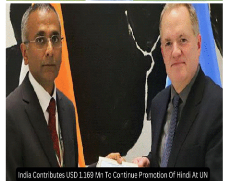
India Contributes USD 1.169 Mn To Continue Promotion Of Hindi At UN

(B) The Government of India has contributed a huge contribution of 1169746 US dollars to the Hindi/UN Project to expand the use of Hindi in the United Nations. The Government of India is making continuous efforts to increase the use of Hindi in the United Nations. Its purpose was to promote the United Nations in Hindi language, as well as to spread greater awareness among millions of Hindi-speaking people about the global issue.