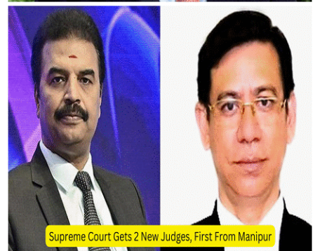
Supreme Court Gets 2 New Judges, First From Manipur