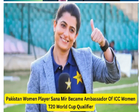
Pakistan Women Player Sana Mir Became Ambassador Of ICC Women T20 World Cup Qualifier

(A) The International Cricket Council is pleased to announce Pakistan ace Sana Mir as the ambassador for the ICC Women's T20 World Cup Qualifier, supported by Dream 11. Sana who has represented her country in 226 international matches. As captain, 137 will keep a close eye on the 10 teams and their players participating in the two-week long tournament.