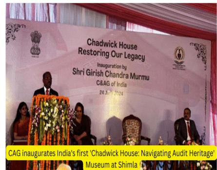
CAG inaugurates India's first 'Chadwick House: Navigating Audit Heritage' Museum at Shimla

(C) Comptroller and Auditor General of India inaugurates Chadwick House: Navigation Audit Heritage Museum. The museum is an important milestone in the preservation and celebration of the rich heritage of the institution and its contribution to the governance of the country. Chadwick House is an important site with a rich and detailed history.