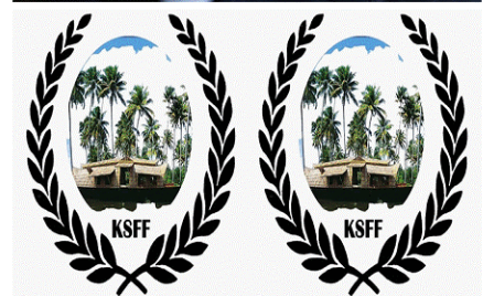
Kerala Short Film Festival on Autism Kerala Short Film Festival on Autism

(D) Thiruvananthapuram Center for Autism and Other Disabilities Rehabilitation Research and Education announced an International Short Film Festival on Autism. The CADRRE International Film Festival on Autism, called CIFA, invited entries from short films of one to five minutes in length that explore diverse narratives and experiences related to autism in a positive manner, organizers said.