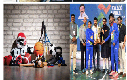
Kalaingar Sports Kit Scheme

(C) Tamil Nadu Youth Welfare and Sports Development Minister Udhayanidhi Stalin recently announced a pioneering scheme aimed at nurturing sports talent at the grassroots level. The Kalaingar Sports Kit initiative, named after late Kalaingar Karunanidhi, is set to provide sports kits to 12000 gram panchayats across the state.