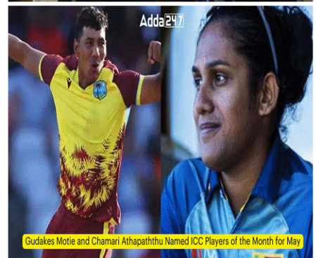
Gudakesh Moti and Chamari Athapaththu Named ICC Players of the Month for May

(C) West Indies left-arm spinner Gudakesh Moti has won the ICC Men's Player of the Month for his impressive performances in several months. Gudakesh Pearl had achieved a lot of success in the three-match home series against South Africa. In the women's category, Sri Lanka's Chamari Athapaththu has been given the ICC Women's Player of the Year award for May 2024.